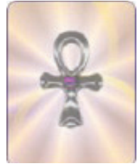
Hand-crafted 7/8 inch silver Ankh with amethyst stone & 24 inch sterling silver chain

Most of us have shields that have formed over our heart and heart chakras due to life experiences. Over time, the Ankh supportively dissolves these barriers, enabling you to give and receive more love.